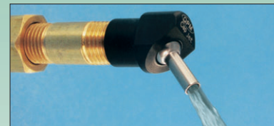
CapJet shown installed on end of threaded pipe.

Material: Body: Acetal Ball & Extension: Stainless Steel Maximum Pressure: 150 PSI (10 bar) Maximum Operating Temperature: 160°F (70°C)